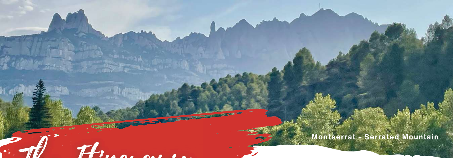
Montserrat - Serrated Mountain