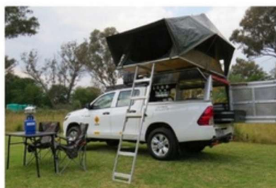
Sleeps 2 persons in 1 rooftop tents