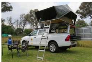
Sleeps 2 persons in 1 rooftop tents