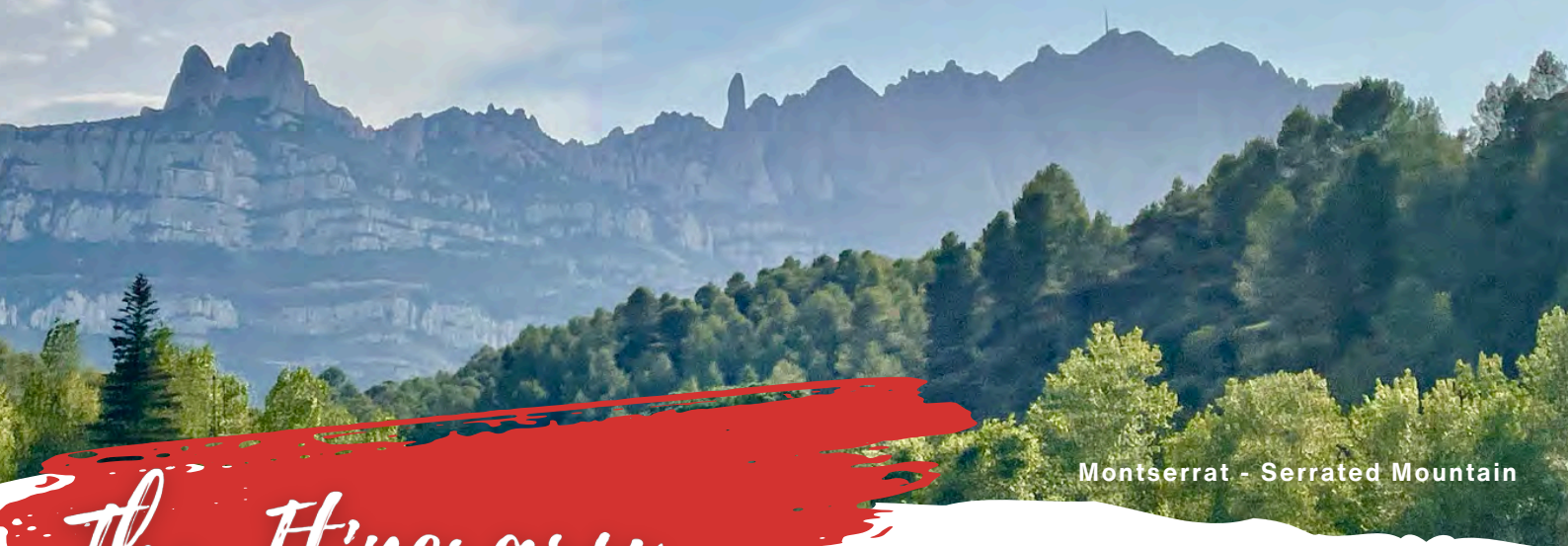
Montserrat - Serrated Mountain